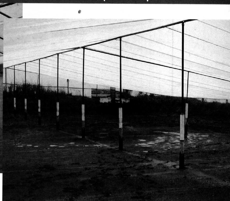
Pond covers built with bamboo poles (left) are functional and initially inexpensive, but may not last as long as covers constructed with more permanent materials.