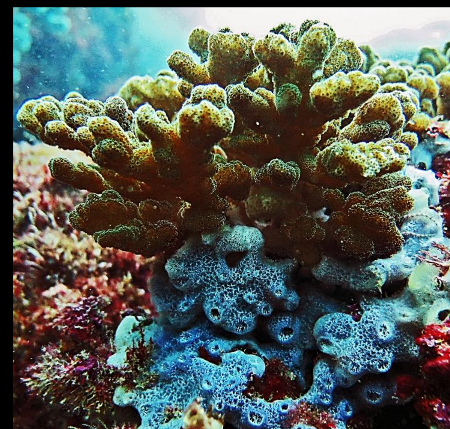
Fig. 5. Ecological interaction observed in the shallow waters of El Pelado MPA (Ecuador) between the coral Pocillopora sp. and Callyspongia cf. californica