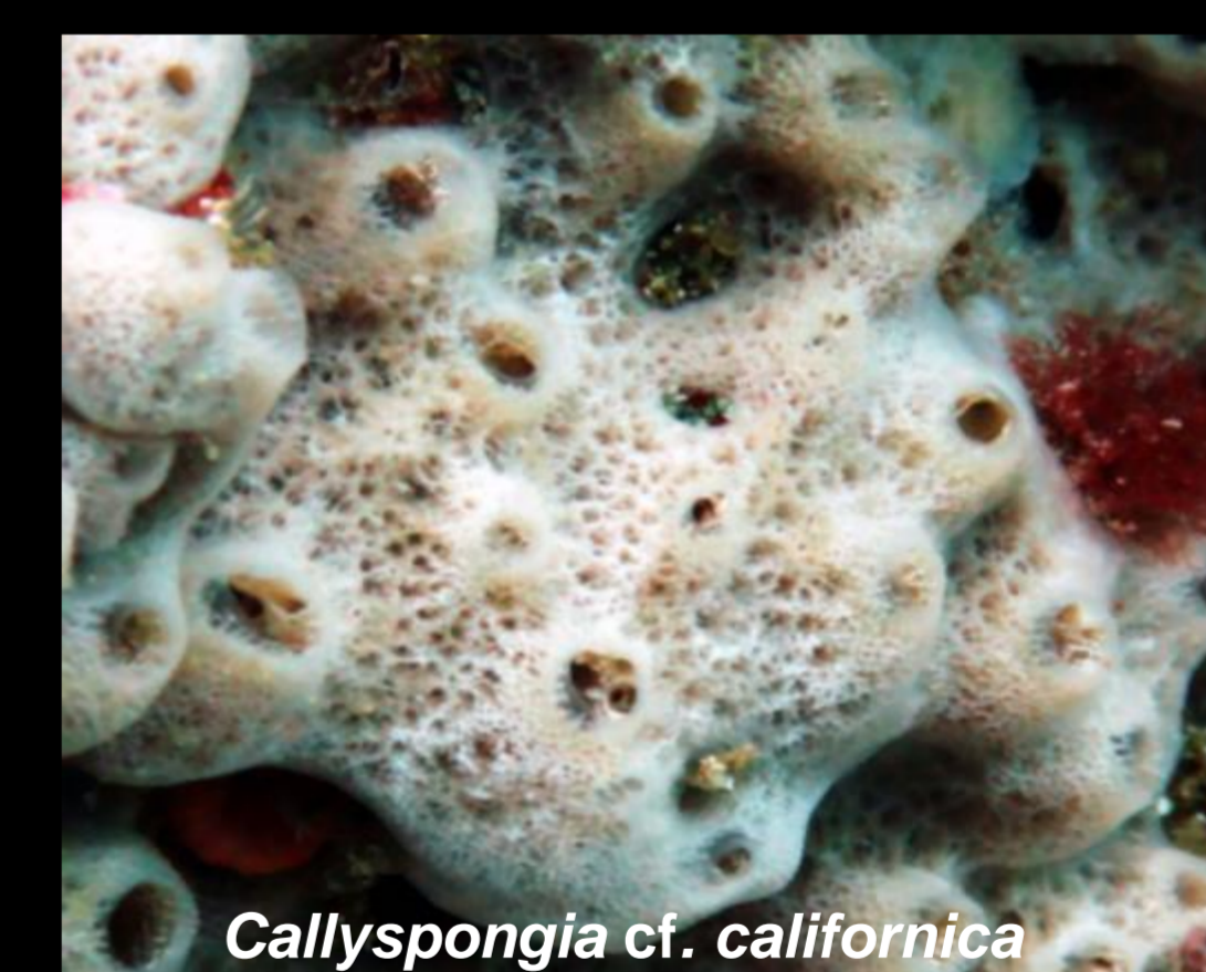
Fig. 6. In situ photograph of Callyspongia cf. californica , the sponge most commonly found in direct interaction with the coral Pocillopora sp. at El Pelado Marine Protected Area (Ecuador).